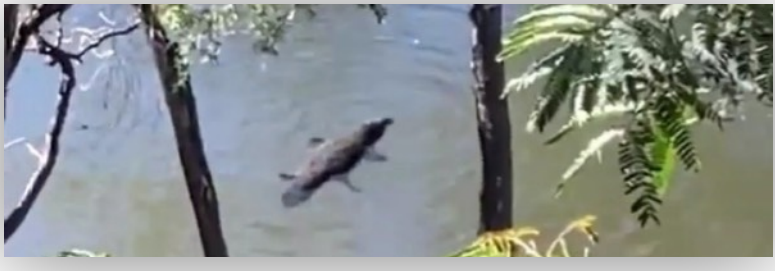
PUTTY CREEK PLATYPUS