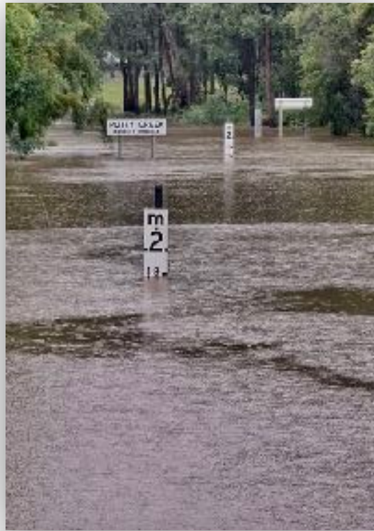
BPOOTY BRIDGE Thursday 3 March at 5pm 1.8 metre mark - Pix: KIMMY STOKES