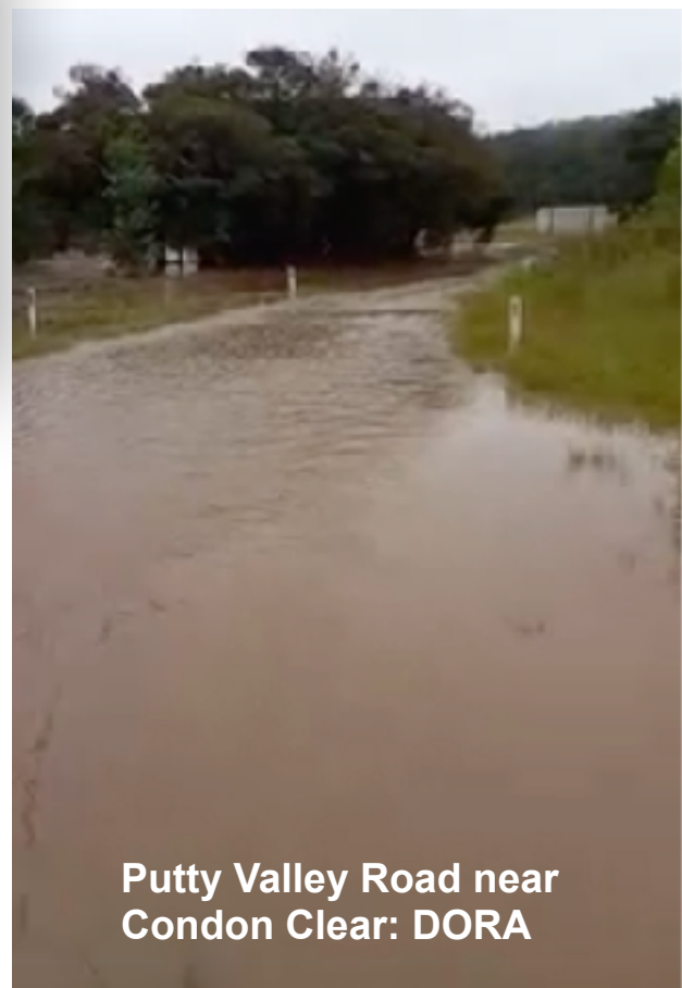
Putty Valley Road near Condon Clear: DORA