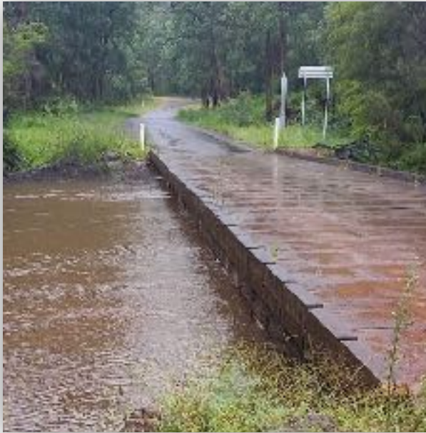
Wednesday 2nd March