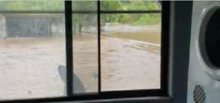
CATRINA: GETTING A LITTLE CLOSE TO THE HOUSE . . .