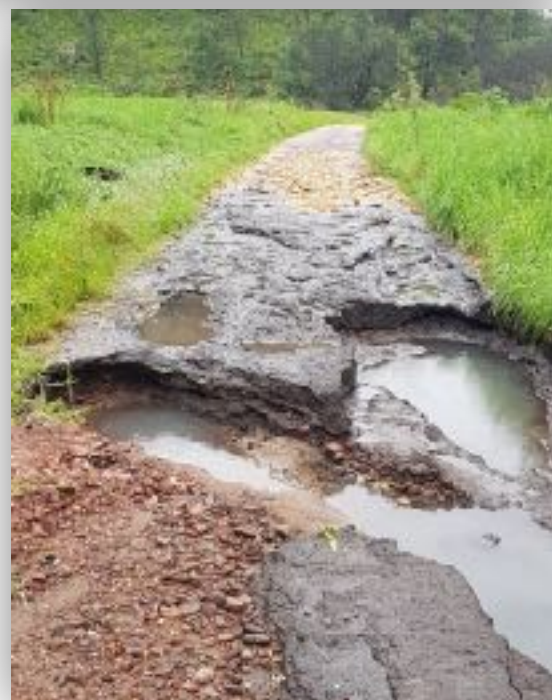
PUTTY VALLEY ROAD near the old timber yards.