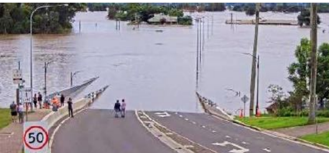
WINDSOR BRIDGE UNDER WATER (FACEBOOK)

But having to run generators for more than four days because of an unexpected power failure and with no way to buy more fuel made life difficult. Not only that, with the price of fuel rising at a dramatic rate the cost added to the household bills.