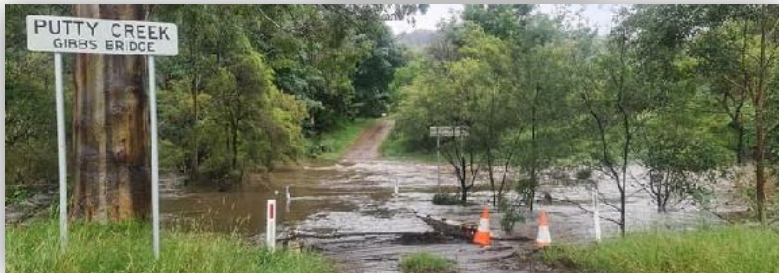
GIBBS CREEK BRIDGE 3 March at 5.35pm