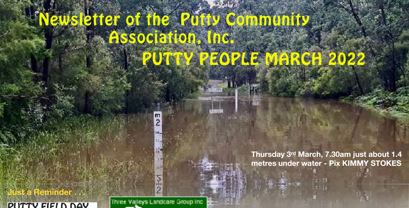
Thursday 3 rd March, 7.30am just about 1.4 metres under water - Pix KIMMY STOKES