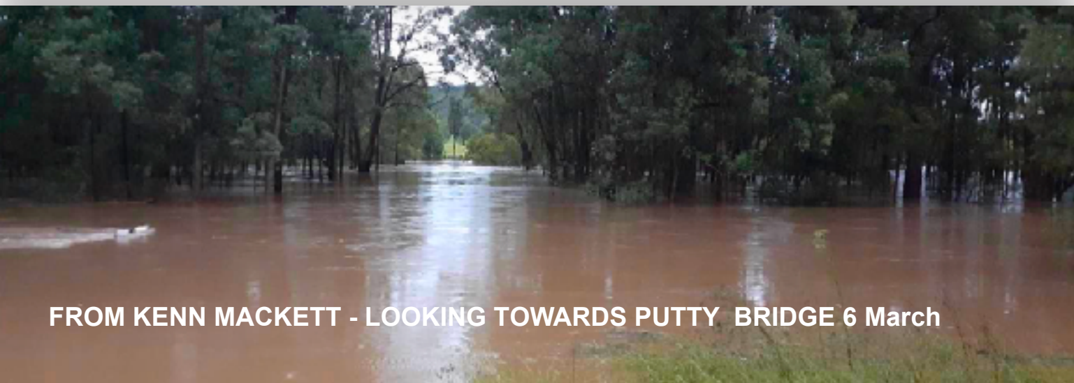
FROM KENN MACKETT - LOOKING TOWARDS PUTTY BRIDGE 6 March