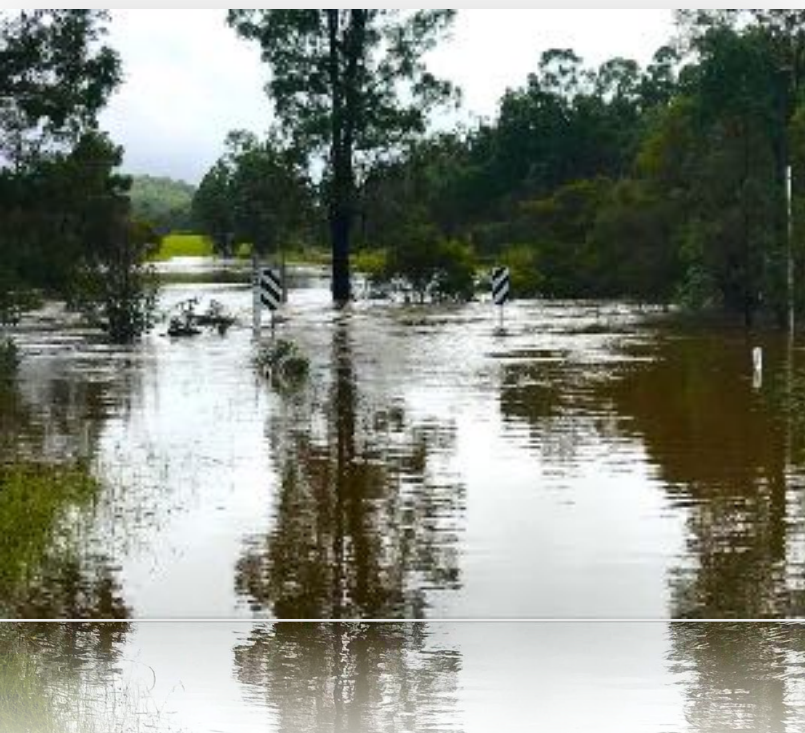
BURNT ARM ROAD / ROSEWILL DRIVE bridge.

By mid- morning, on the 4 th March Putty Creek level was starting to drop.