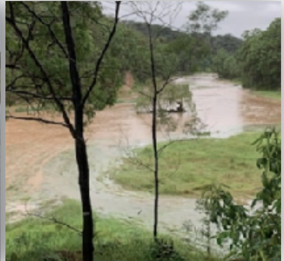
FROM KATHY MACKENZIE