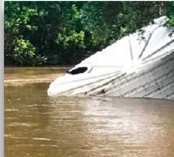
MICHELLE'S TANK AFLOAT