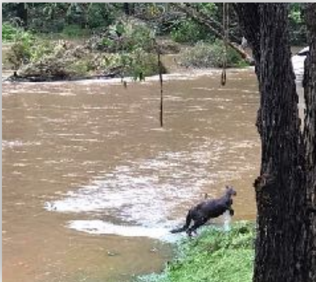
A ROO JUST HOPPED ACROSS THE CREEK TO VISIT MICHELLE