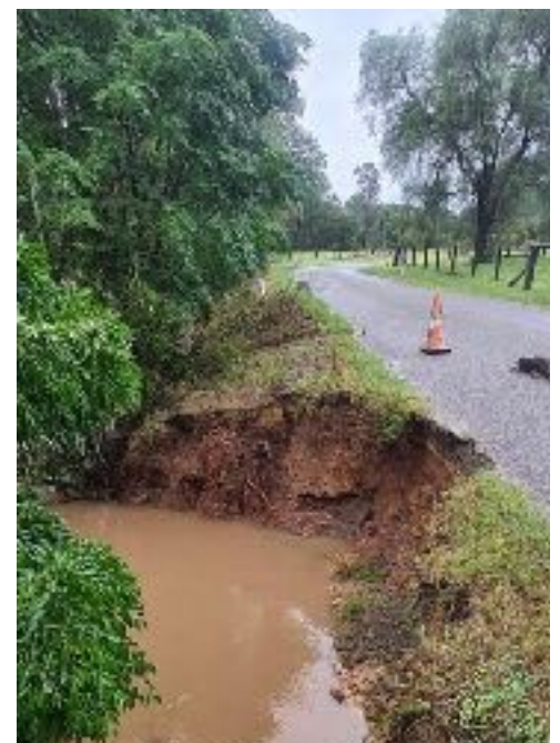
WASHOUT UNDERNEATH PUTTY VALLEY ROAD NEAR JUNE MALMBERG'S PLACE