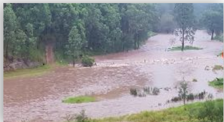
PUTTY VALLEY ROAD 8 March, 2022

By mid- morning, on the 4 th March Putty Creek level was starting to drop.