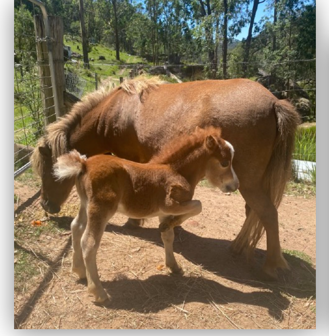
PALEIS Du PUTTY Beautiful little colt Conan was born on

January 15. He's still staying close to his Mummy Cino but is rearing to go!