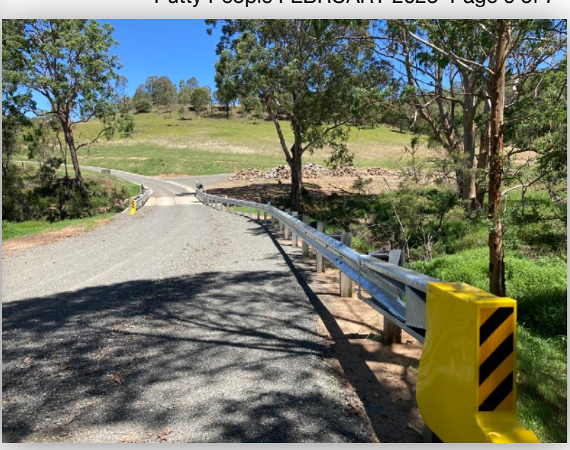
GIBBS BRIDGE - NOW COMPLETED, LOOKING SOUTH