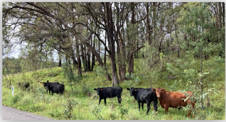
OTHER BEAUTIFUL PUTTY RESIDENTS

January 15. He's still staying close to his Mummy Cino but is rearing to go!